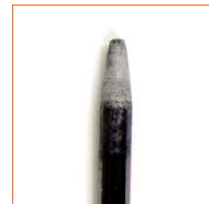
Discoloration and whitened tips on silicon (right) and titanium emitter points (left).