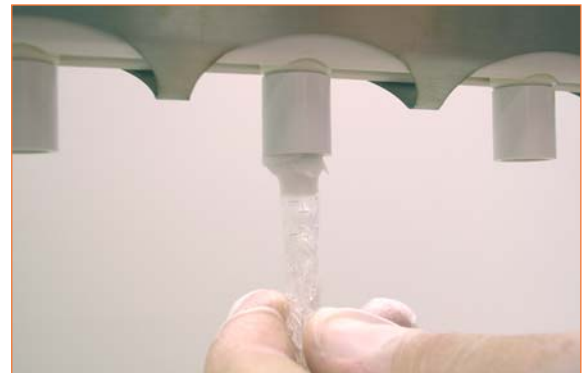
The Emitter Point Cleaner in action.

Ion's Emitter Point Cleaner is an efficient solution for cleaning emitter points in a cleanroom environment. The cleaner consists of a small plastic ampule encasing